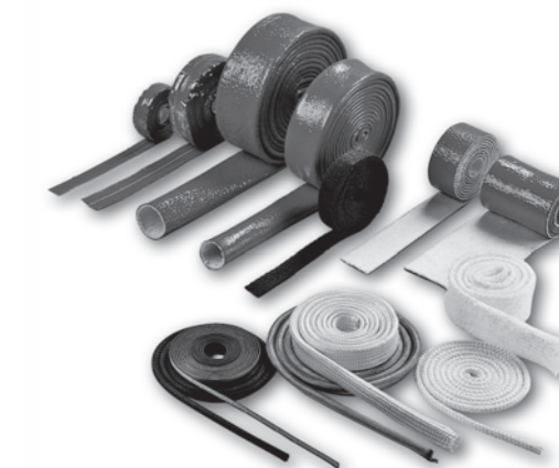
High temperature insulation

CULIMETA AUTOMOTIVE – THE FIRST TO PLACE THE SOUND ABSORPTION ON THE EXHAUST SYSTEM.