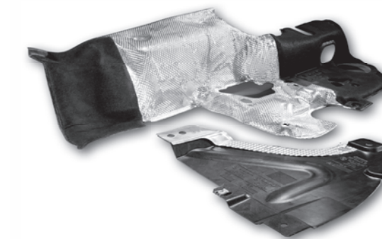
Stamped and formed parts