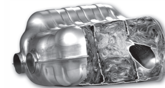
Absorption materials for exhaust silencer